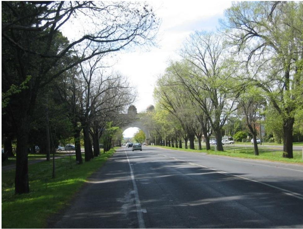
Ballarat Avenue of Honour