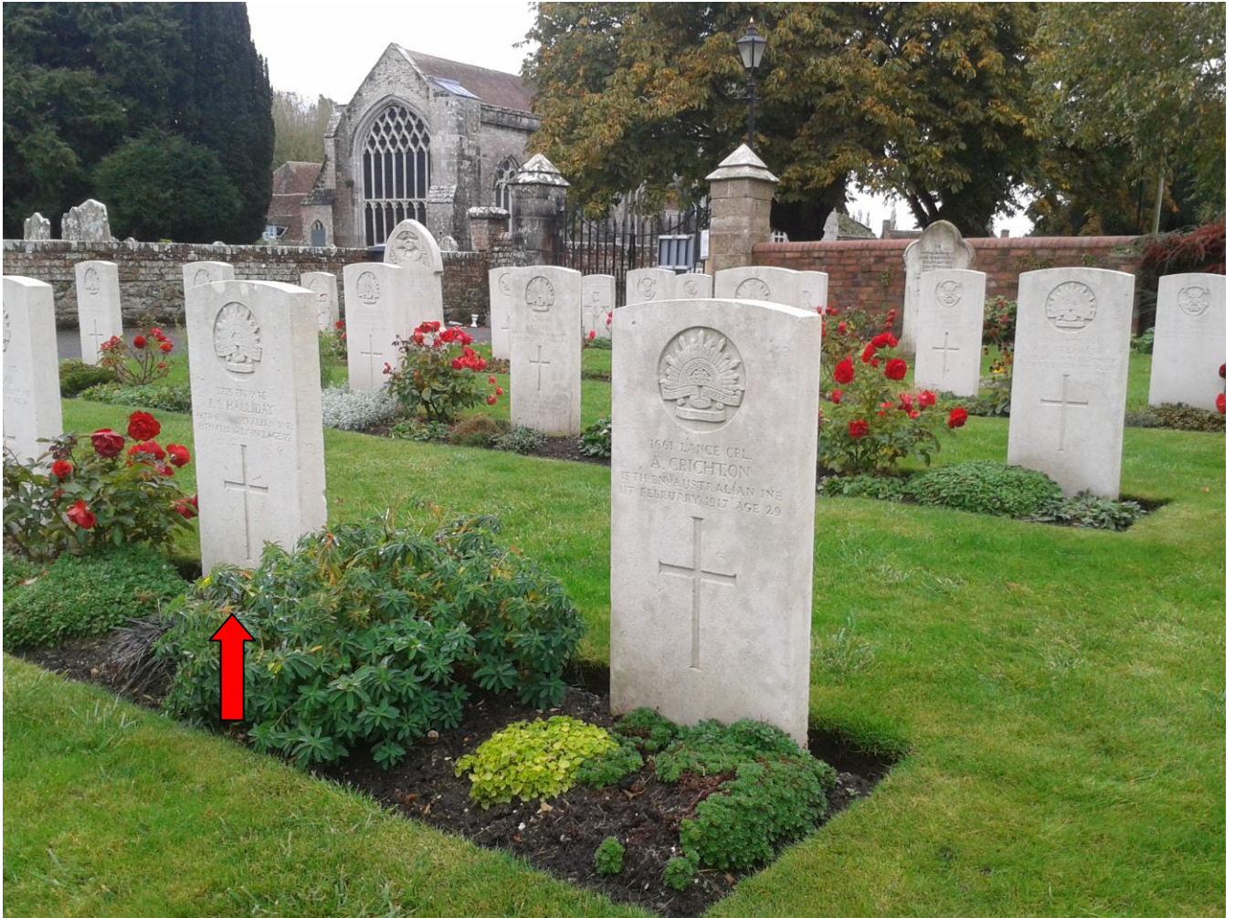
Private R. S. Halliday's headstone shown with red arrow